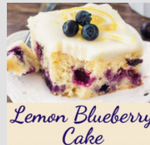
Lemon Blueberry Cake